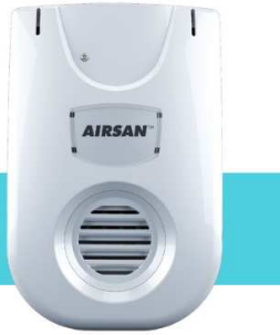
Airsan™ Odor Neutralizer