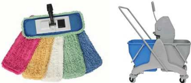
Microfiber for safety and economy